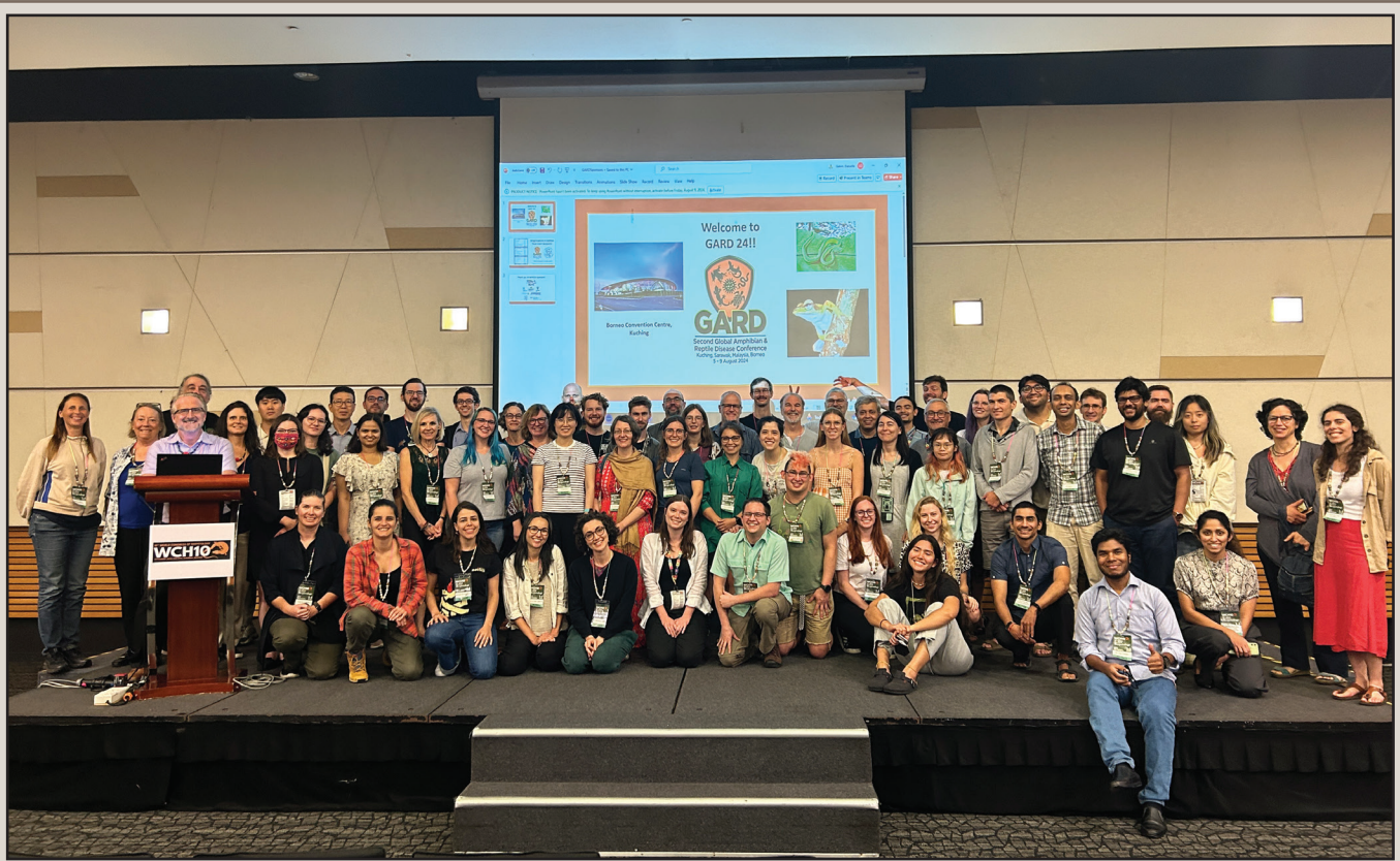
FIG. 1. Participants in the Global Amphibian and Reptile Disease 2024 Conference at the August 2024 World Congress of Herpetology 10, Kuching, Malaysia.

from South America serve as definitive hosts for invasive snake lungworms ( Raillietiella orientalis ) from Southeast Asia. Additionally, Terry and Foufopoulos (2024) reported sex-specific responses to infection with the hemoparasite Hepatozoon in Erhard's Wall Lizards ( Podarcis erhardii ) in Greece, and Picelli et al. (2024) used molecular and microscopic techniques to comprehensively assess hidden hemoparasite diversity in lizards, snakes, chelonians, and anurans in Namibia and Angola.